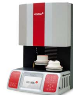
GEMINI LT PRESS